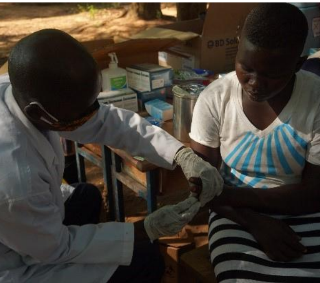
An Adolescent receiving services during one of the outreaches conducted in Adjumani District to improve access and utilization of SRHR/GBV services.