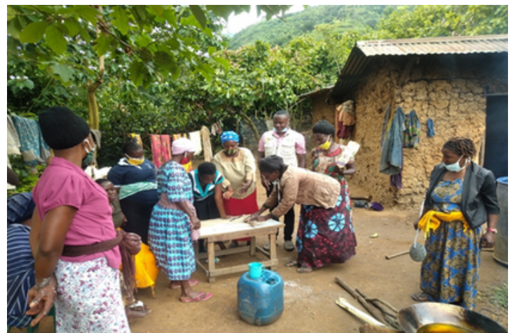
Training of women in livelihood skills in Bukonzo Sub County, Bundibugyo District, in Western Region.

This represents 76.6 % of the estimated need for 2020.