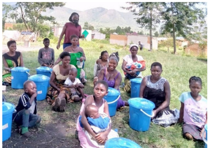
UNFPA, through ACORD, supported women and girls affected by floods by delivering dignity kits, hygiene kits and sanitary pads in parts of Kasese District, Western Uganda.

people reached with SRH/HIV/GBV information