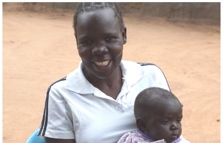
A young mother who delivered safely after being transferred from Midigo HC IV to Lacor Hospital thanks to an ambulance provided by UNFPA.

5,343 people reached with SRH/HIV/GBV information