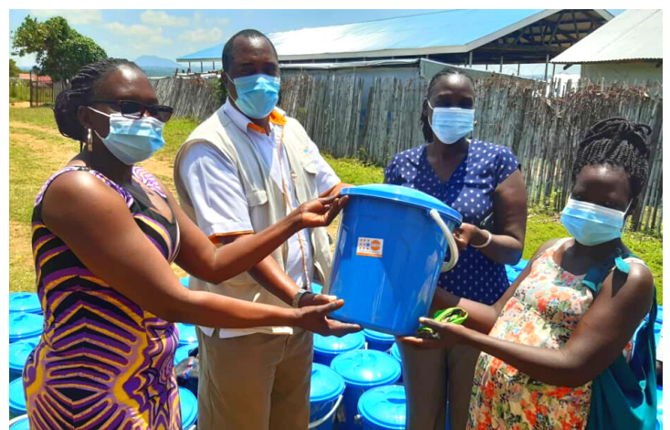
The Rhino Camp refugee camp settlement in Terego district received 115 dignity kits from UNFPA on 13 August 2020.

people reached with SRH/HIV/GBV information