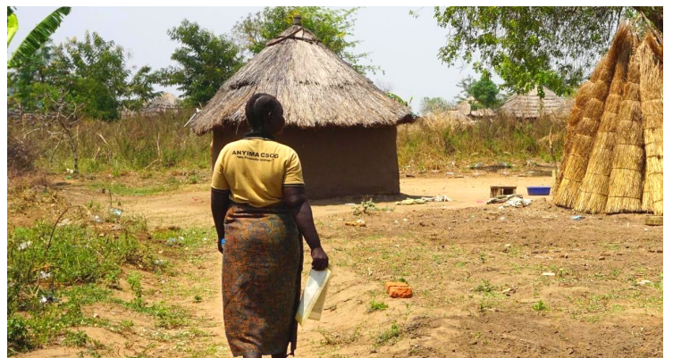
GBV survivor, @ Patricia Nangiyo, UNFPA Uganda

6,586 people reached with SRH/HIV/GBV information