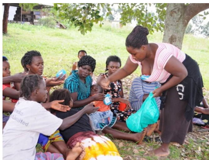
Youth and women in Bundibugyo were provided with Sexual and Reproductive Health information and sanitary pads.